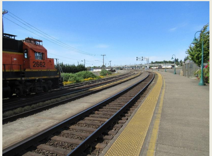
Pictured above - looking north from the Amtrak Station towards the BNSF Yard