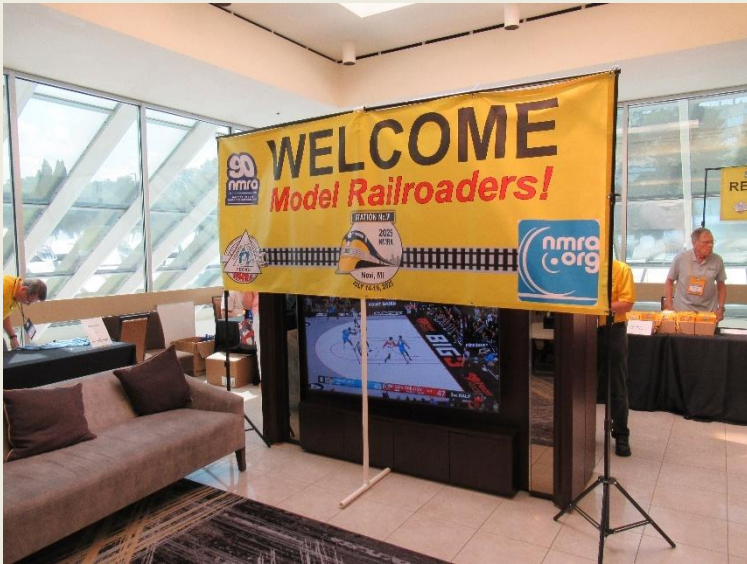
People waiting to get into the National Train Show