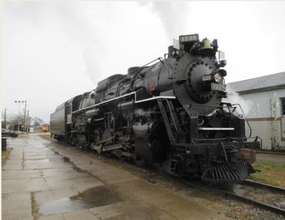
This photo is the Pere Marquette Steam Engine # 1225, from the Steam Railroading Institute.