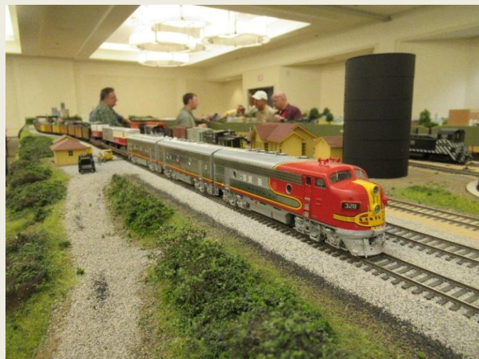
Ho Train Layout on Display