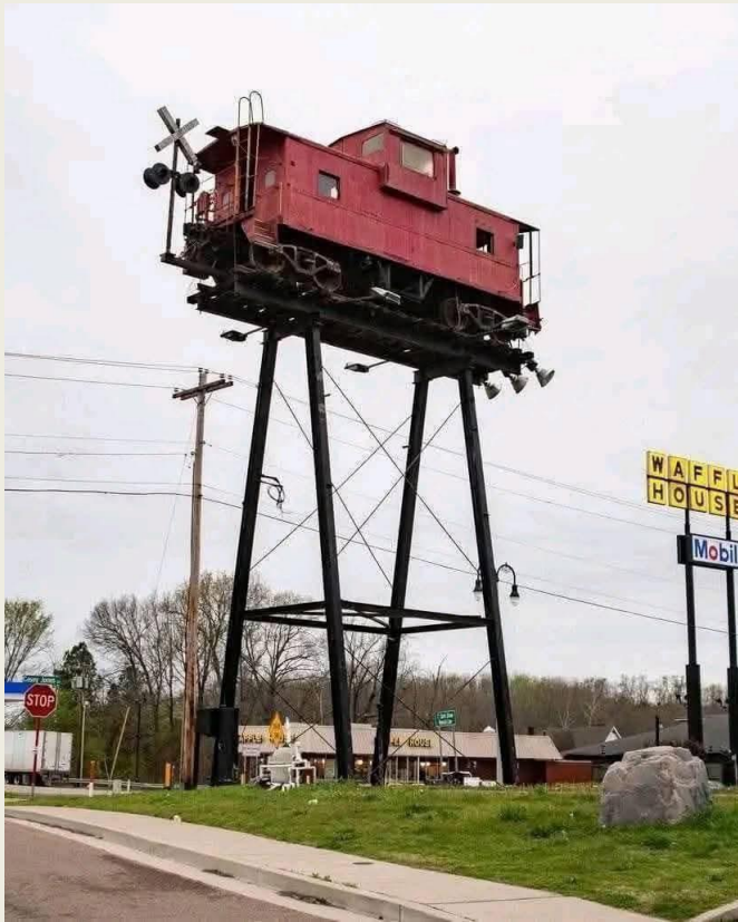
"Caboose in a second life"

Here are some more ideas for possible modeling challenge projects. Refer to the June Yardmaster issue for even more ideas to consider.