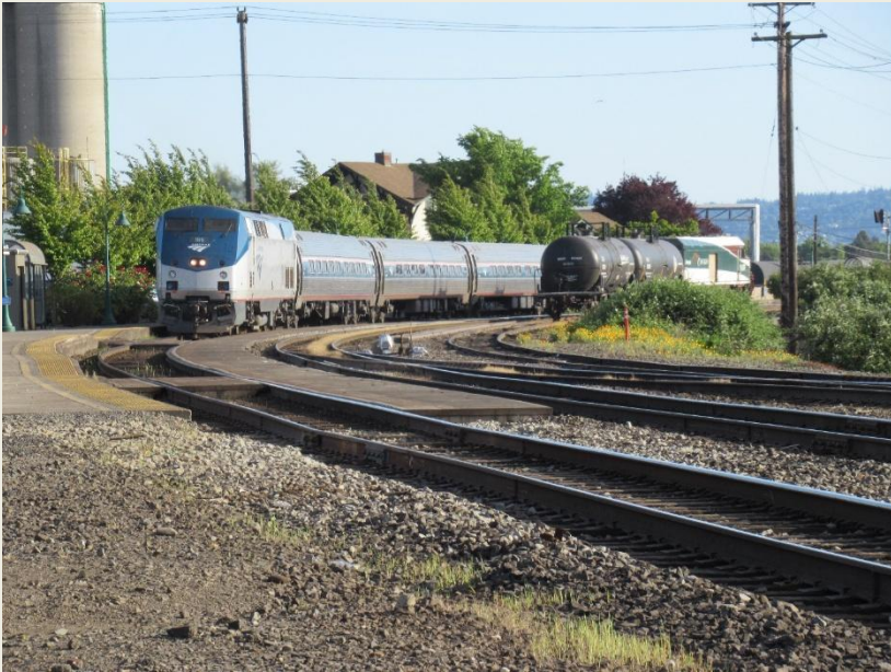
Another Amtrak costal passenger train heading north bound.