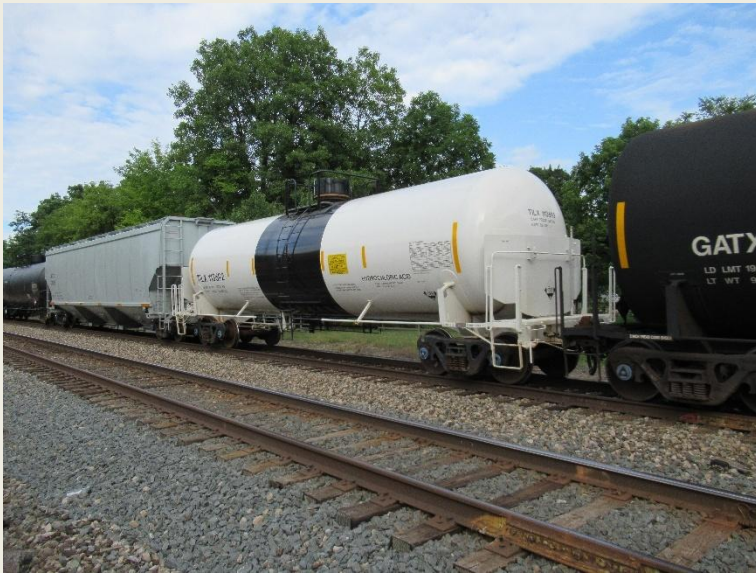
The car above is carrying hydrochloric acid