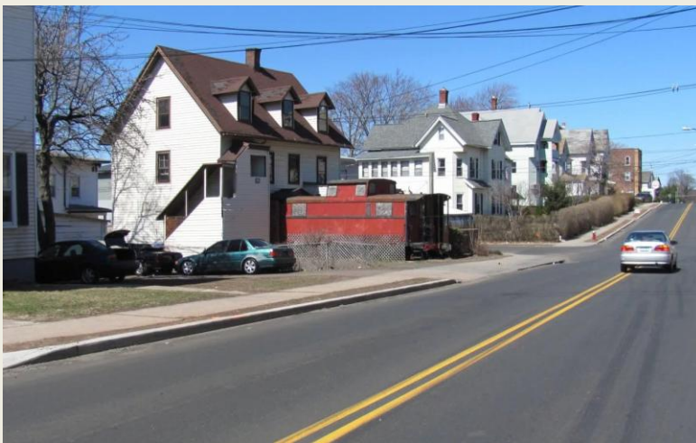
Caboose and a House