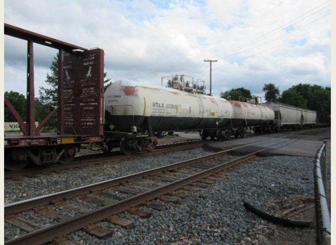
The car pictured below is carrying Hydrogen Peroxide