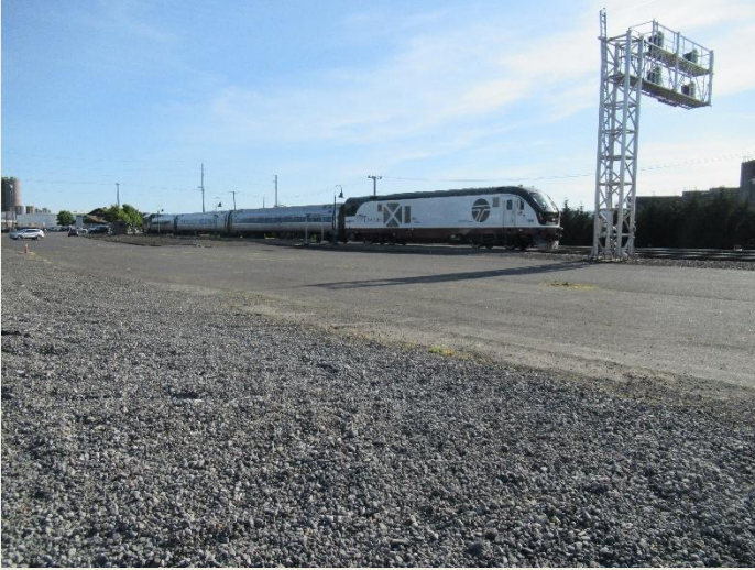
This is one of those Amtrak trains that goes up and down the coast.