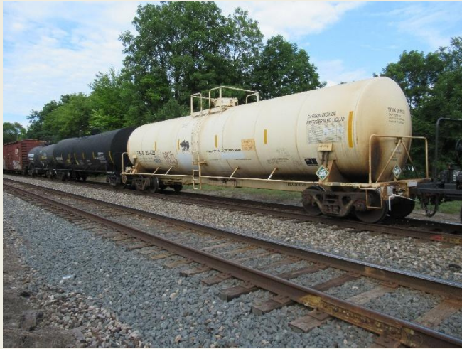
The car pictured at the left is carrying Carbon Dioxide