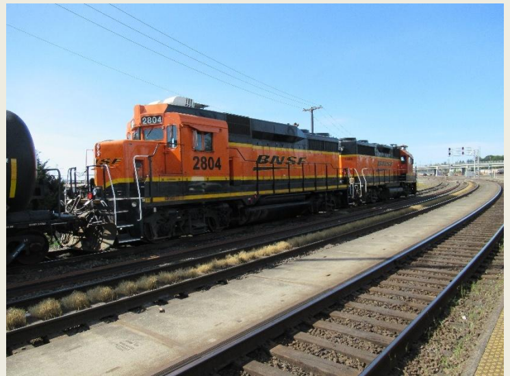
Pictured left is a tank car for water service.