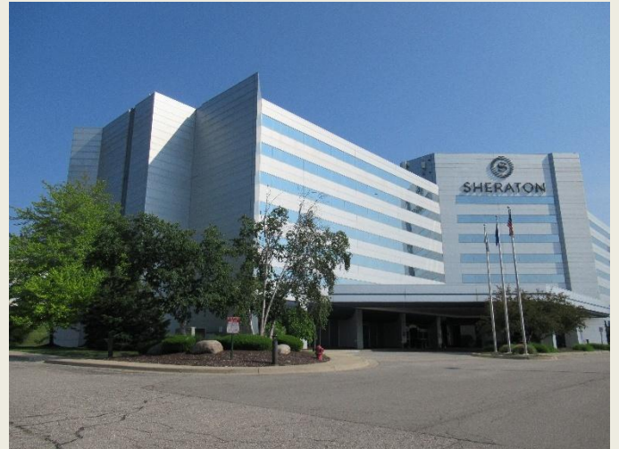
The national train show was at the Suburban Collection Showplace in Novi