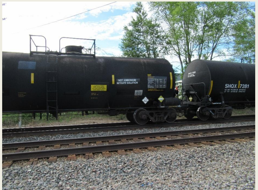
The cars to the right are carrying ammonium nitrate (hot) UN 2426