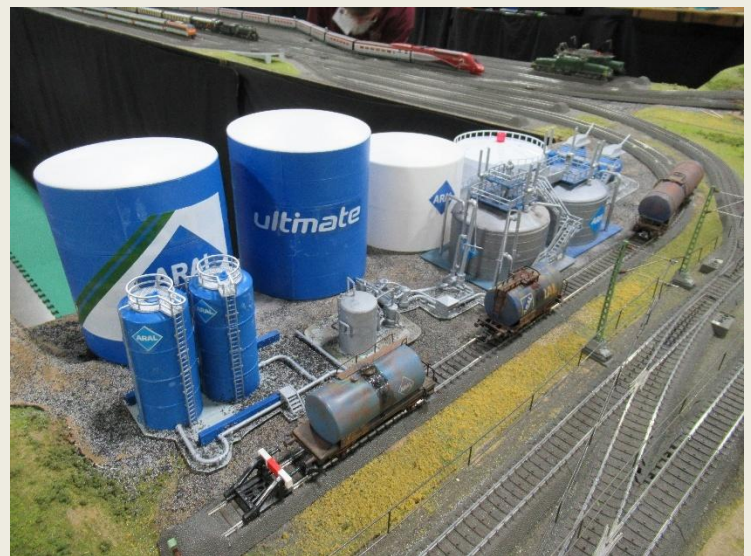
refinery on the European Model Railroad layout (we have two Division 9 members involved with this layout club)