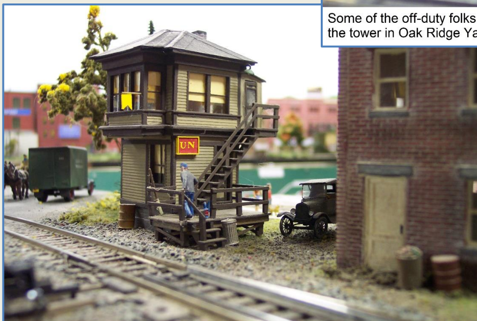
Scratchbuilt PRR tower using drawings of prototype