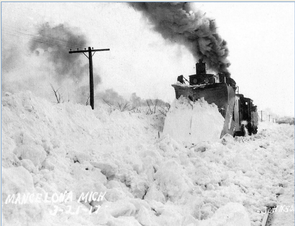
GR&I Snowplow work near Mancelona, Michigan - 03-21-1917