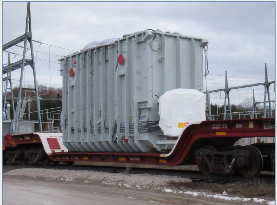
Depressed center Flat with load south of Traverse City, Mi - Dec 2, 2021