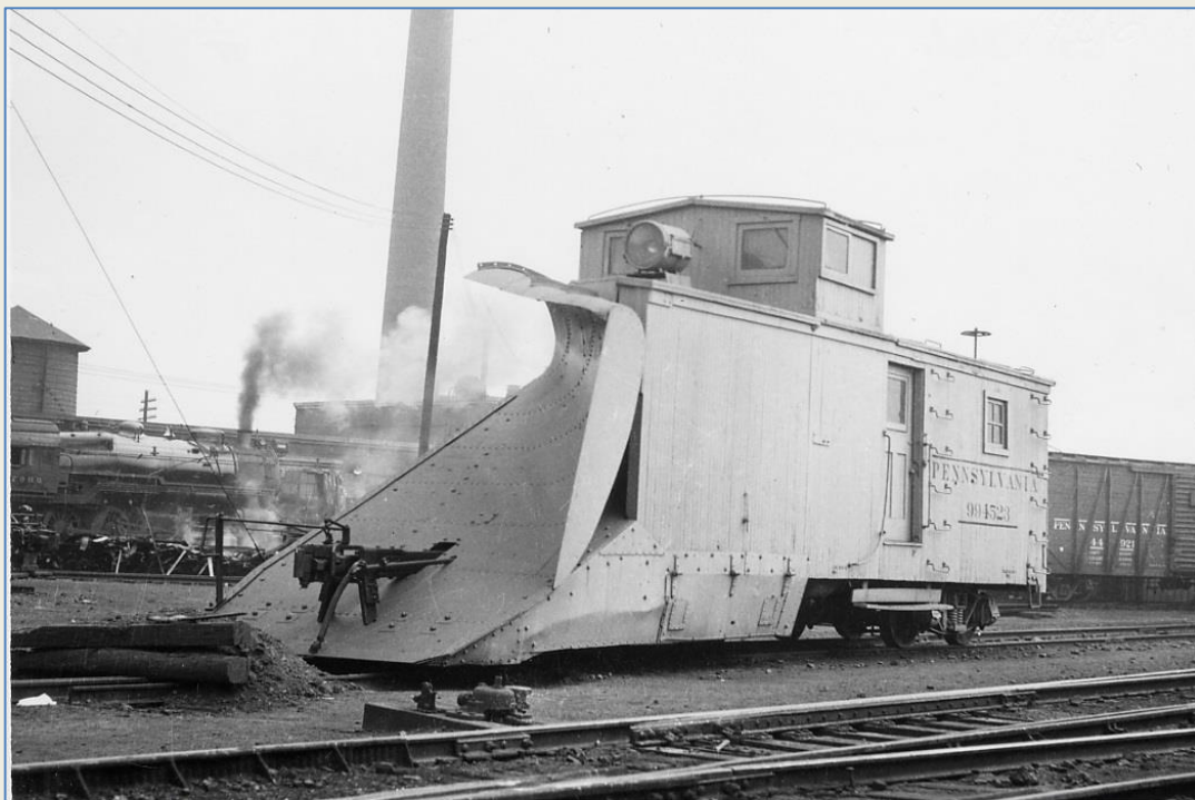
PRR Snowplow #994523 - Wood construction