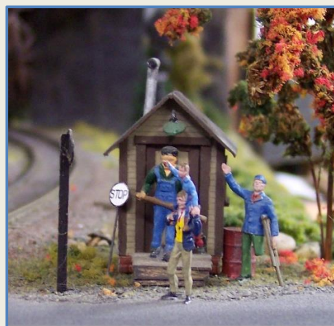
Watchbox at Trooper