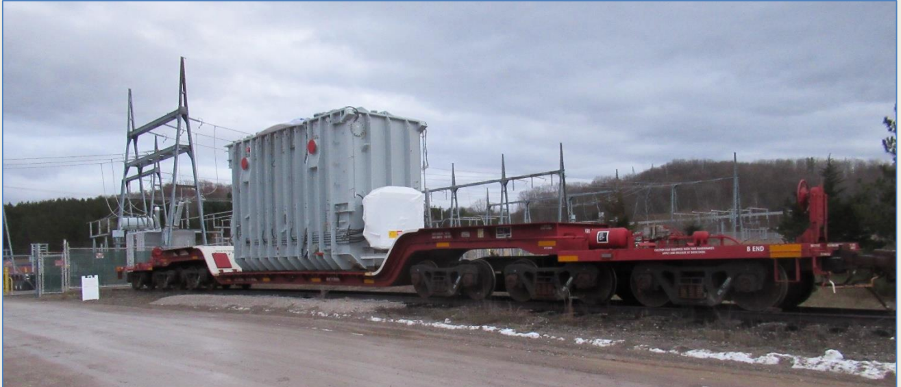
Depressed center Flat Car South of Traverse City, MI - Dec 2, 2021

If you have some photos you've taken or have permission to submit for publication, please send scans of them to your editor for inclusion in our Prototype photo section. If you need help with this, contact Your editor.