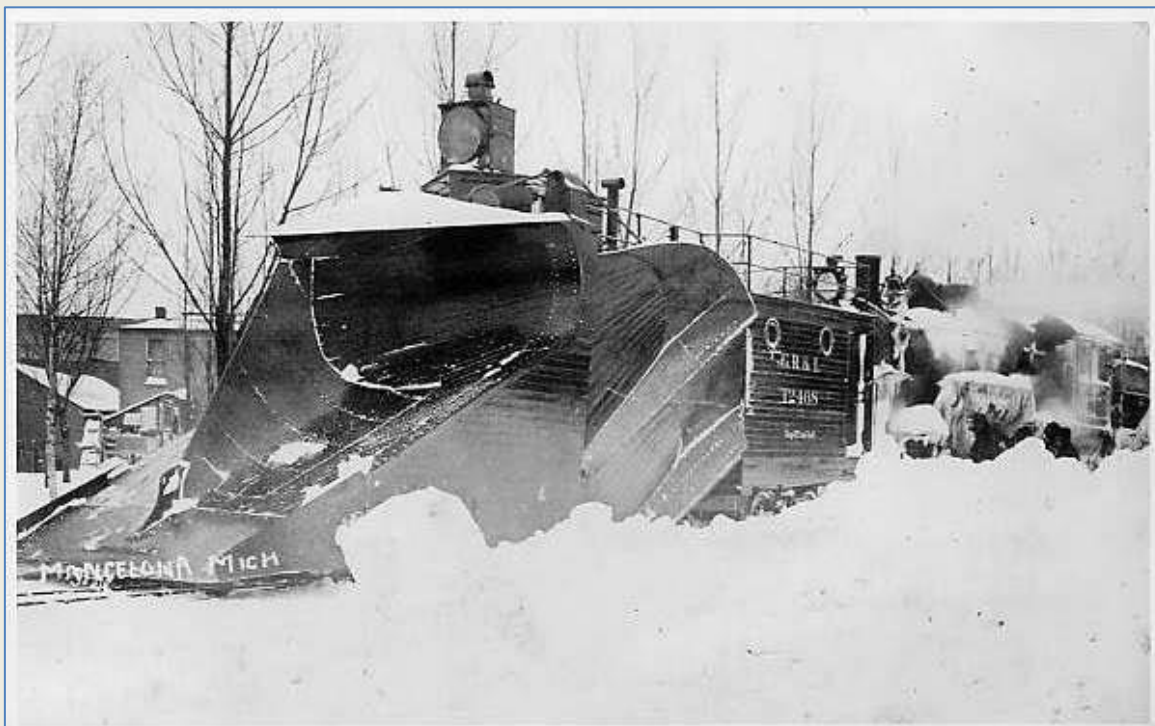
GR&I Snowplow #T2408