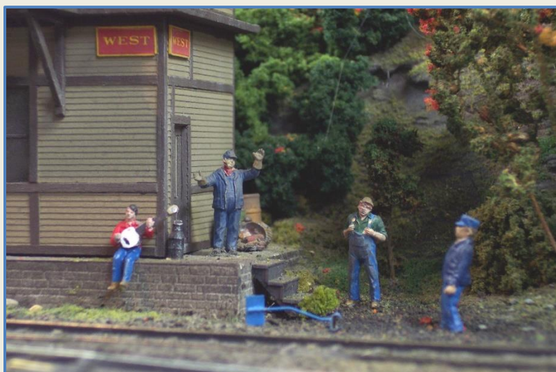
Some of the off-duty folks hanging around the tower in Oak Ridge Yard.