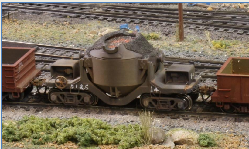
Kling Hot Metal car - State Tool & Die kit