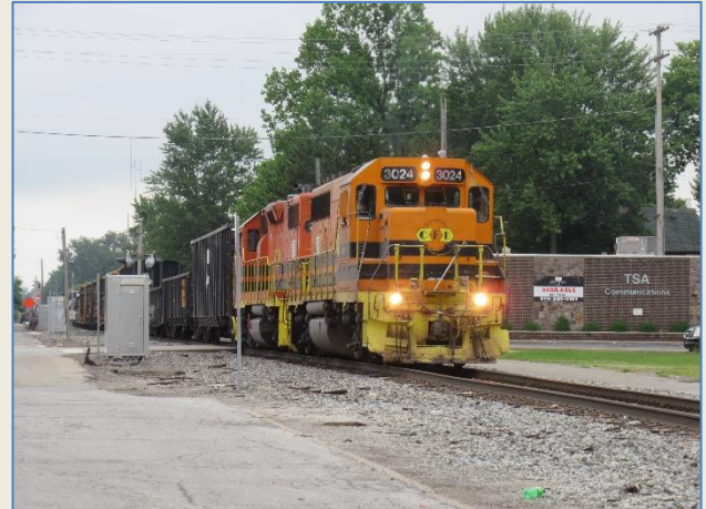
WB G&W mixed freight, Warsaw, IN July 11, 2021