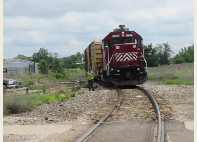
One of the Grand Elk RR engines in Kalamazoo July 2021