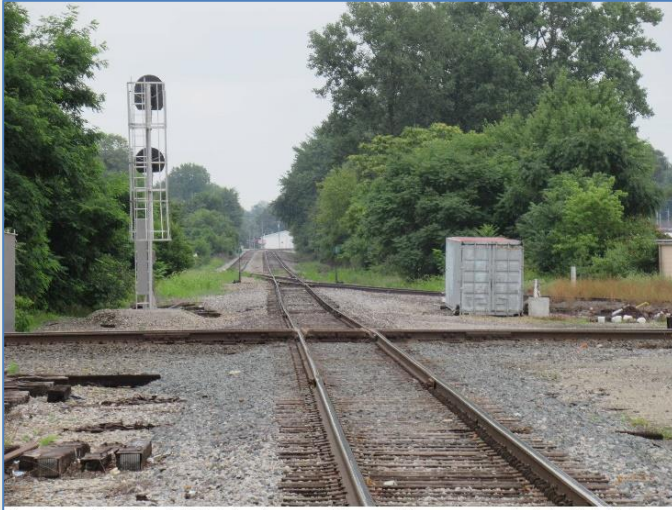
The diamond for NS and G&S trains downtown Warsaw, IN