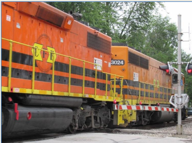
WB G&W mixed freight, Warsaw, IN July 11, 2021