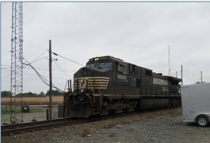
NS train going over the diamond Warsaw, In 7/11/2021