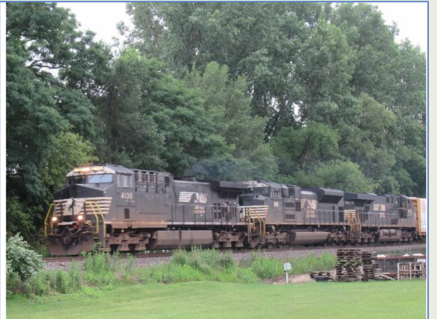
NB NS mixed freight Warsaw, In July 11, 2021