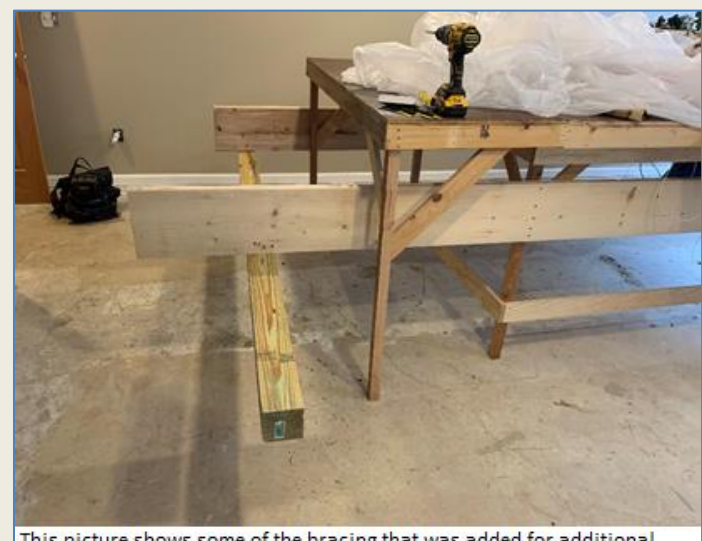
This picture shows some of the bracing that was added for additional support.

jacks, straps, and eye hooks, they slowly went about the process of raising the table one inch at a time. The process went better than expected and only took about 2 to 3 hours to complete the job. The next day the carpeting was installed with problems. A couple of days later the carpenters returned to lower the table, remove the bracing and straps. The train table is once again on