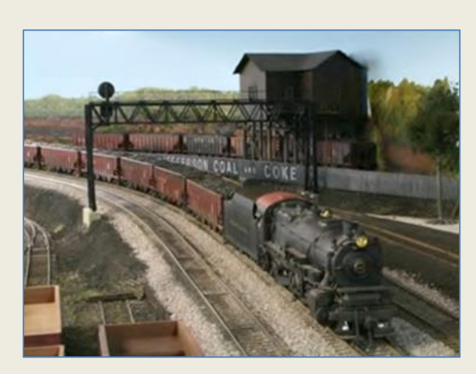
the Pittsburgh, Cincinnati, Chicago and St. Louis Railroad .