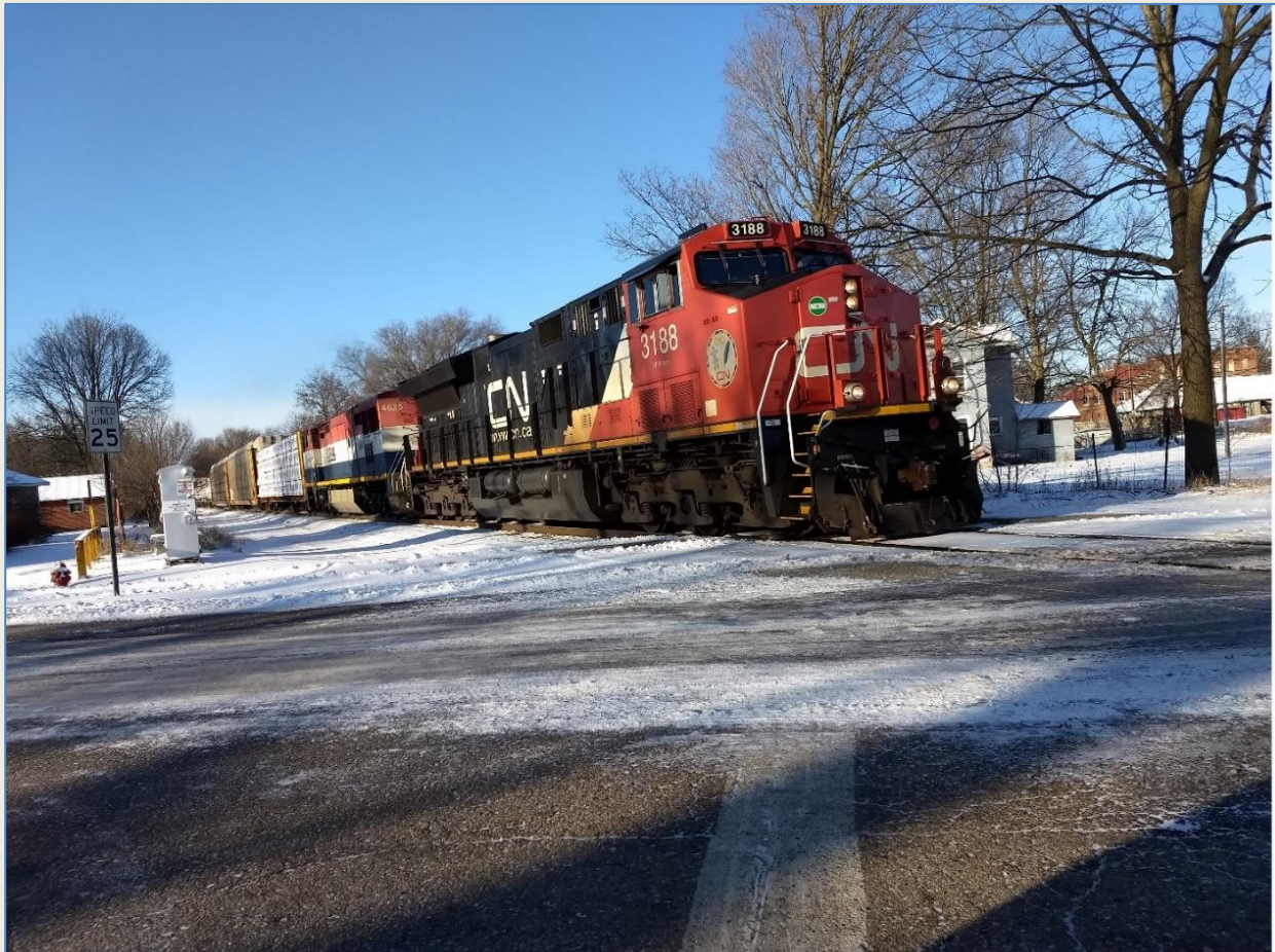
CN EB train last January 21, 2021 at Marcellus, MI.

If you have some photos you've taken or have permission to submit for publication, please send scans of them to your editor for inclusion in our Prototype photo section. If you need help with this, contact Your editor.