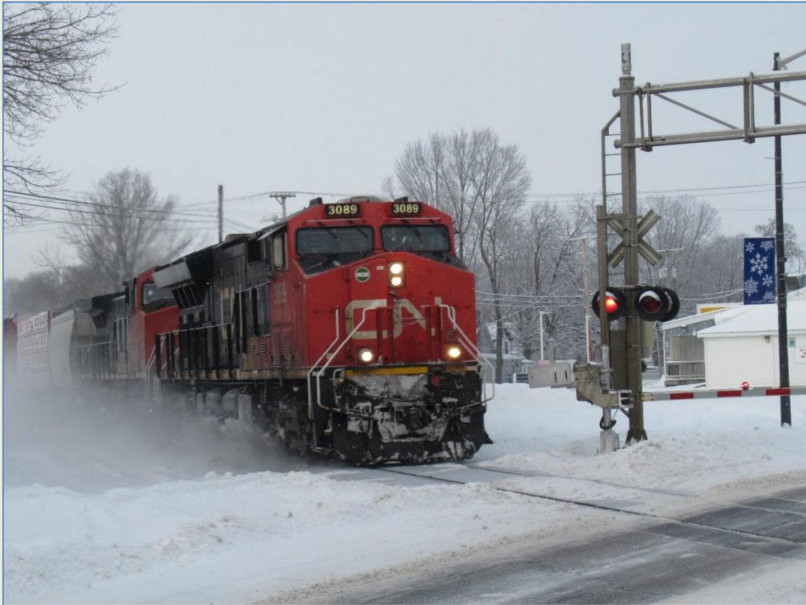
CN train EB in Marcellus, MI Feb 2nd, 2021